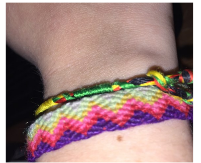
Fashionista// Here are a few bracelets mentioned

The profit from the bracelet went towards removing one pound of trash from the ocean and the coast line. She received